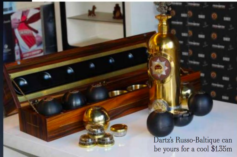
Dartz's Russo-Baltique can be yours for a cool $1.35m

The vodka also goes with any mixer and bolsters any vodka-based cocktail such as passionfruit martinis, espresso martinis and vodka peach sparklers.